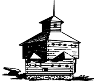
BLOCK HOUSE 1816