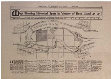
20X14 Map Showing Historical Spots in Vicinity of Rock Island from the Rock Island Daily Union July 25 1915