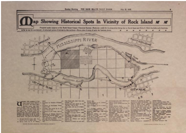
20X14 Map Showing Historical Spots in Vicinity of Rock Island from the Rock Island Daily Union July 25 1915