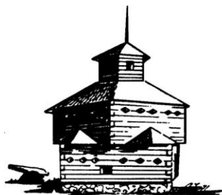
BLOCK HOUSE 1816